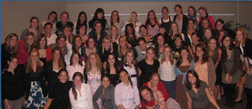
Our whole chapter together before winter break, including our newly initiated members. We missed our girls studying abroad this past quarter!

Fall 2008 Newsletter – Gamma Chi Chapter of the University of Denver